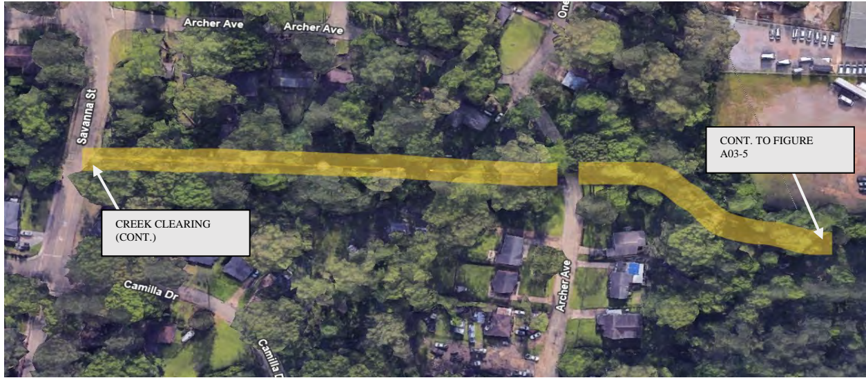
Figure A03-4: PROJECT COJ-07-A03 IMPROVEMENTS