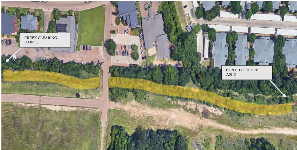
FIGURE A01-2: PROJECT COJ-01-A01 IMPROVEMENTS