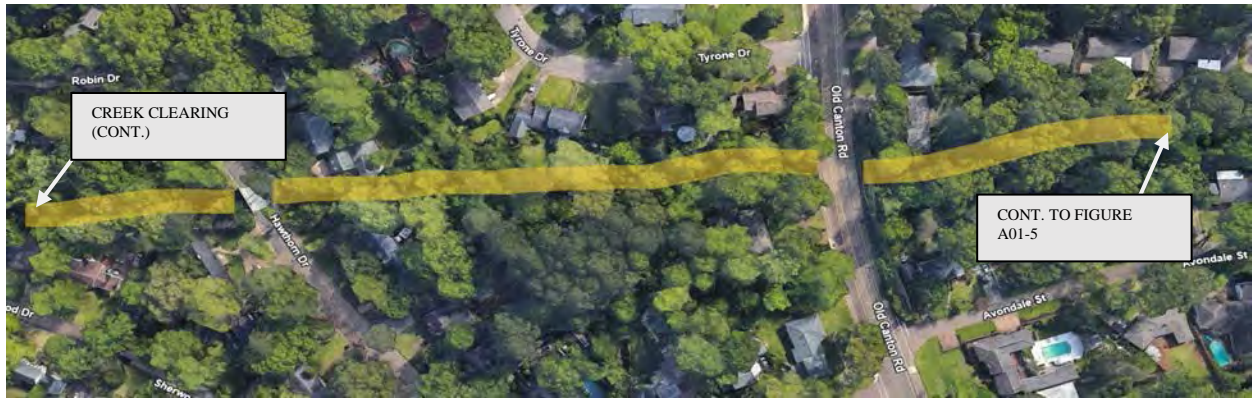
Figure A01-4: PROJECT COJ-07-A01 IMPROVEMENTS