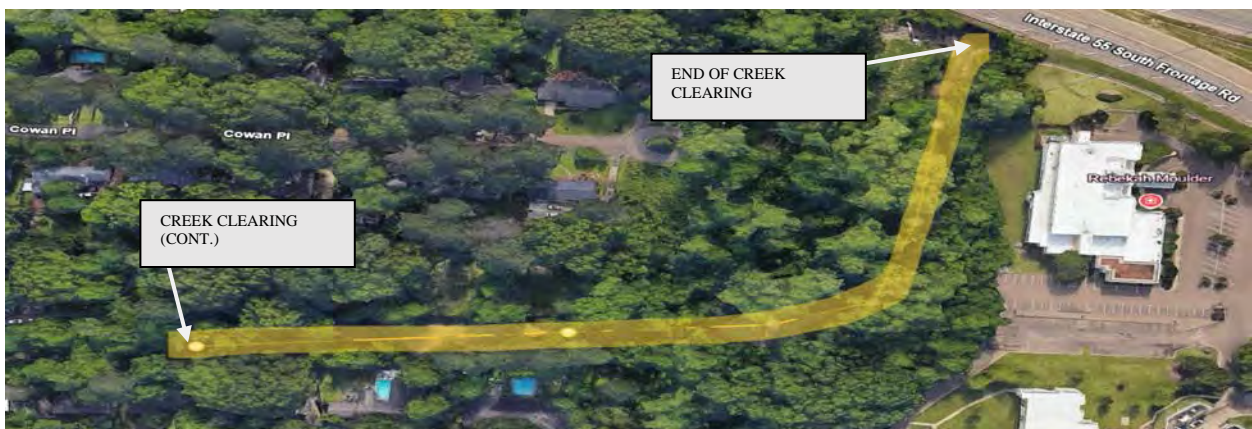
Figure A01-6: PROJECT COJ-07-A01 IMPROVEMENTS