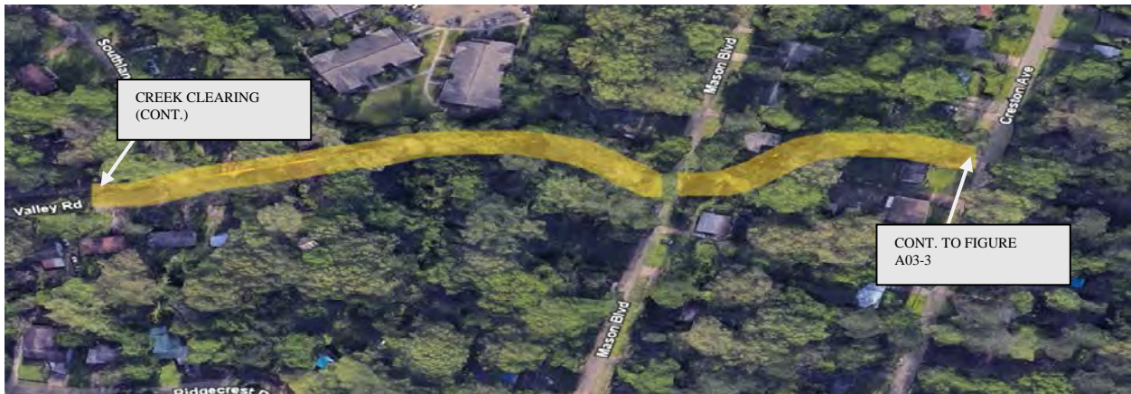
Figure A03-2: PROJECT COJ-07-A03 IMPROVEMENTS