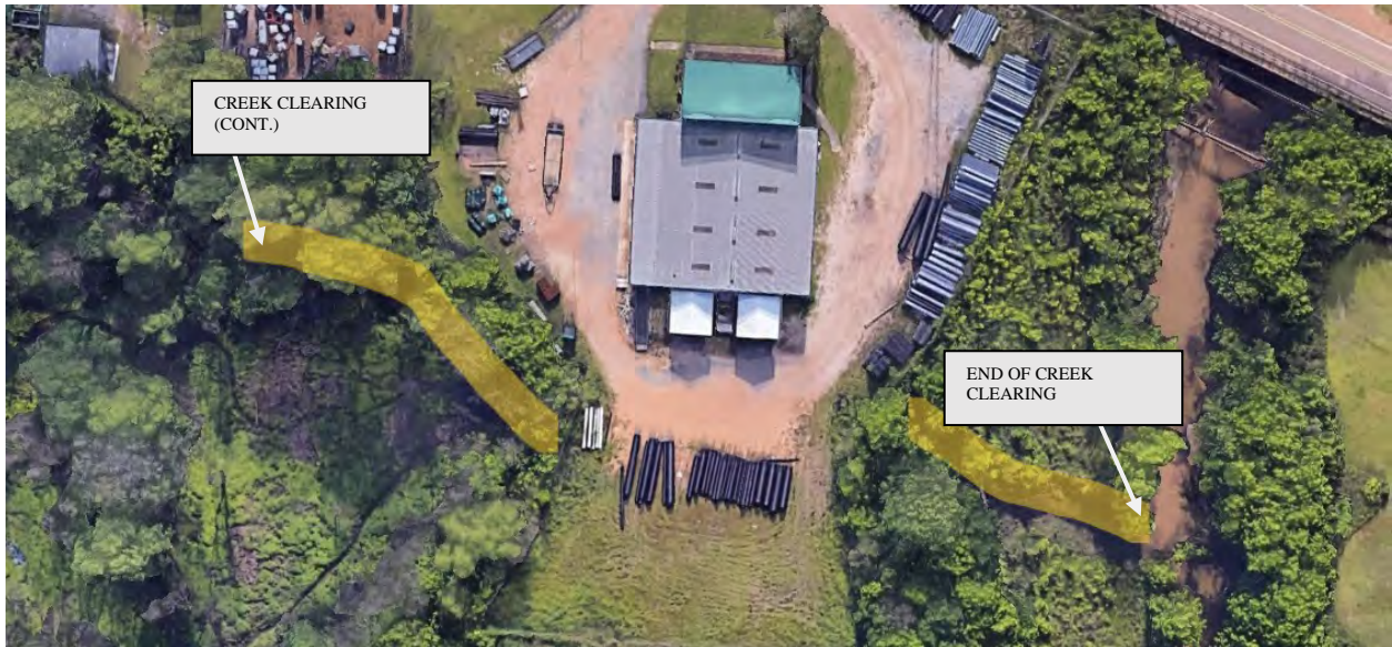
Figure A03-5: PROJECT COJ-07-A03 IMPROVEMENTS