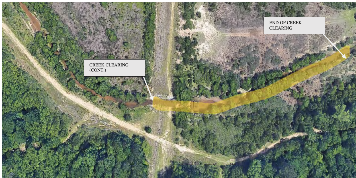
FIGURE A01-4: PROJECT COJ-01-A01 IMPROVEMENTS