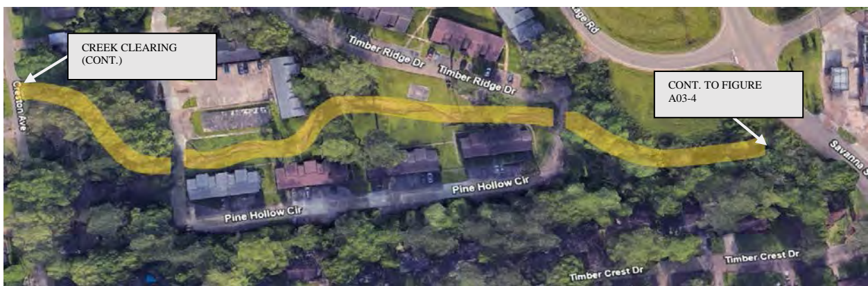
Figure A03-3: PROJECT COJ-07-A03 IMPROVEMENTS