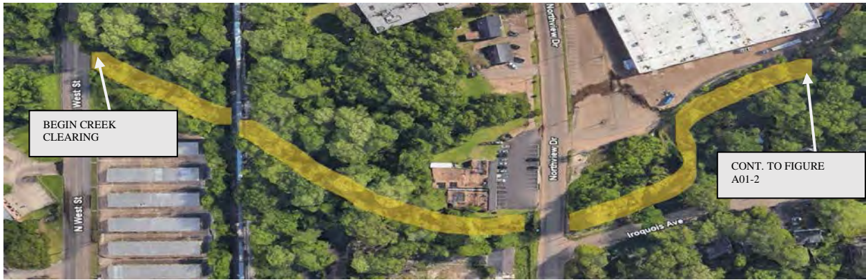
Figure A01-1: PROJECT COJ-07-A01 IMPROVEMENTS