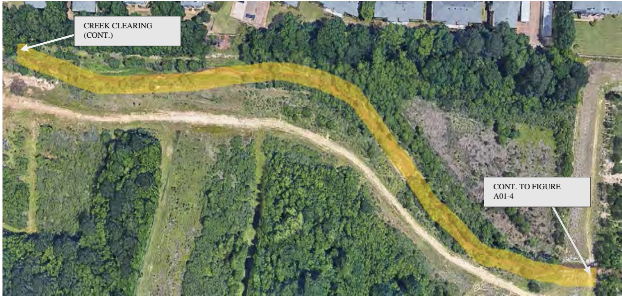
FIGURE A01-3: PROJECT COJ-01-A01 IMPROVEMENTS