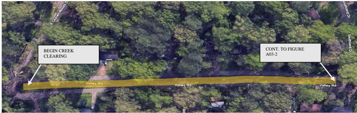
Figure A03-1: PROJECT COJ-07-A03 IMPROVEMENTS