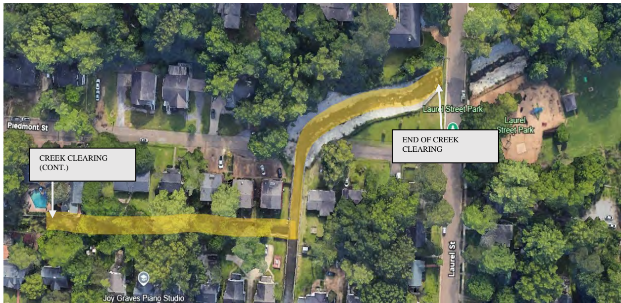
Figure A02-2: PROJECT COJ-07-A02 IMPROVEMENTS