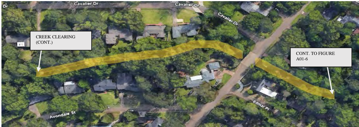
Figure A01-5: PROJECT COJ-07-A01 IMPROVEMENTS