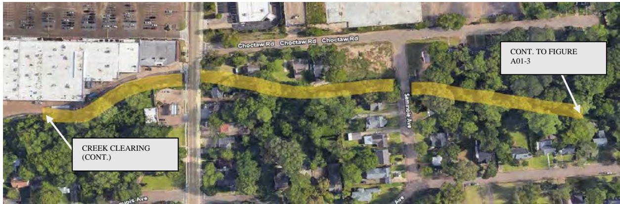
Figure A01-2: PROJECT COJ-07-A01 IMPROVEMENTS