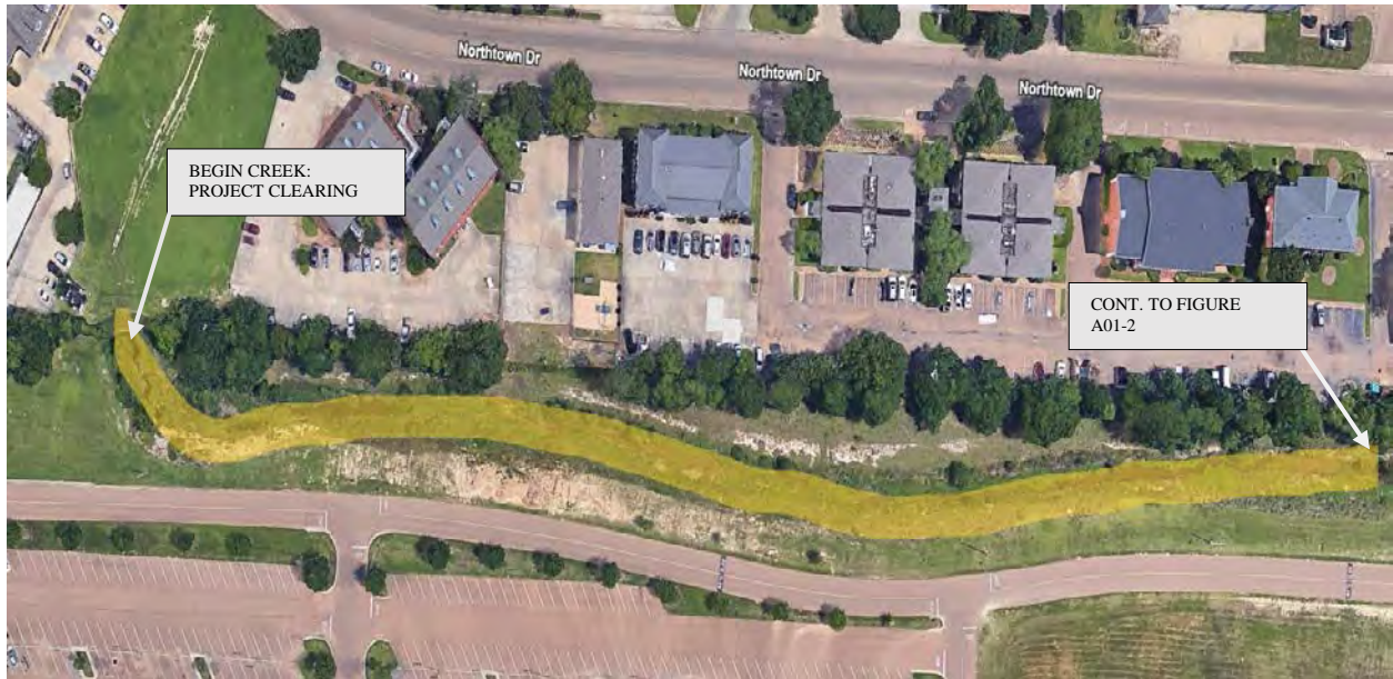
FIGURE A01-1: PROJECT COJ-01-A01 IMPROVEMENTS