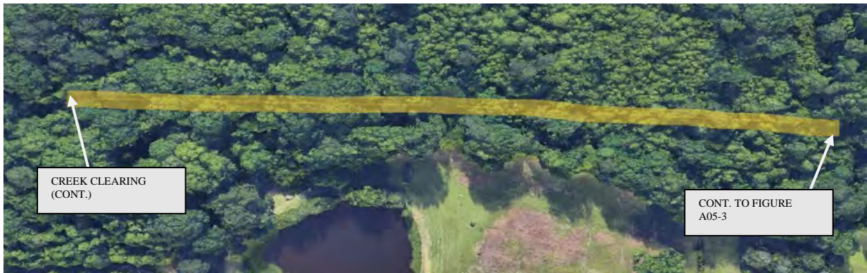
Figure A05-2: PROJECT COJ-04-A05 IMPROVEMENTS