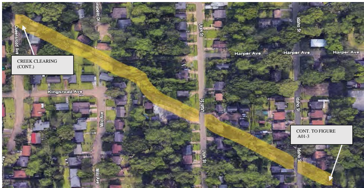
Figure A01-2: PROJECT COJ-04-A01 IMPROVEMENTS