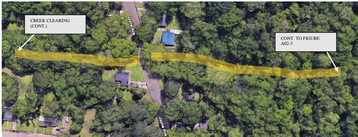
Figure A02-2: PROJECT COJ-04-A02 IMPROVEMENTS