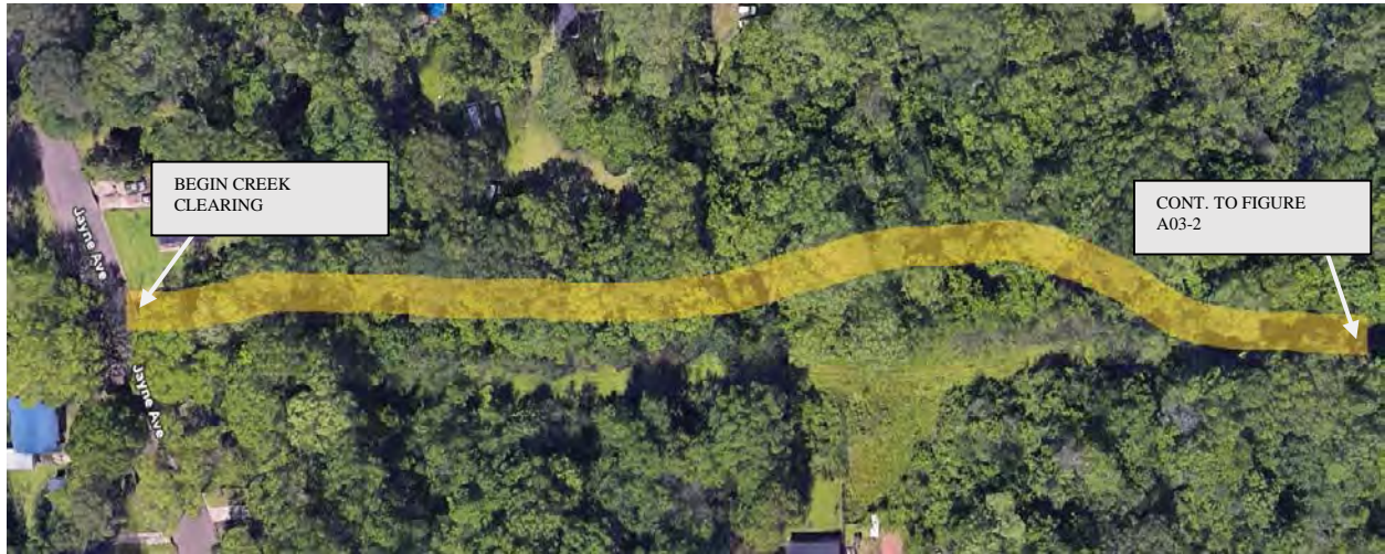
Figure A03-1: PROJECT COJ-04-A03 IMPROVEMENTS