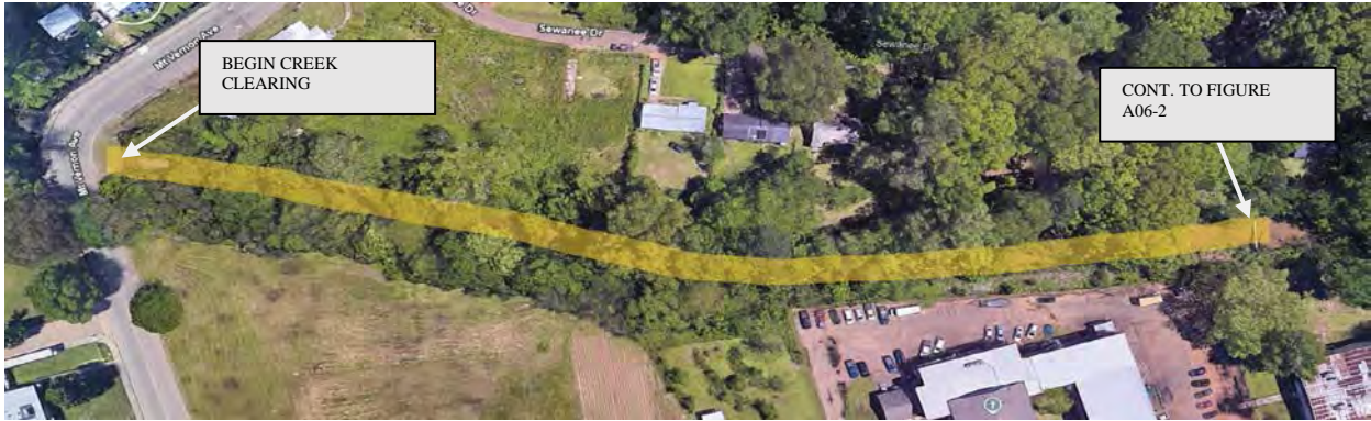
Figure A06-1: PROJECT COJ-04-A06 IMPROVEMENTS