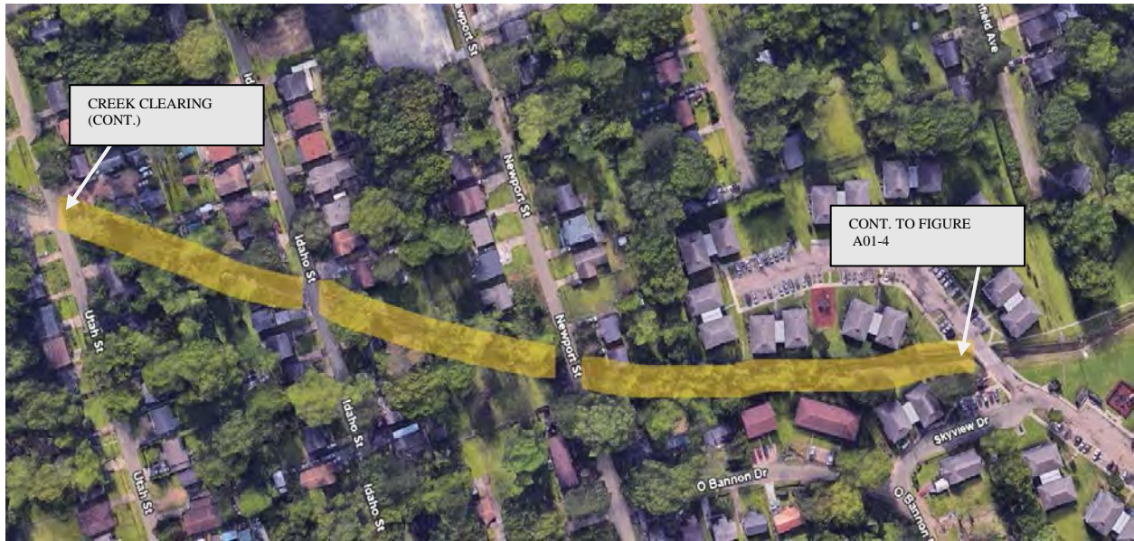
Figure A01-3: PROJECT COJ-04-A01 IMPROVEMENTS