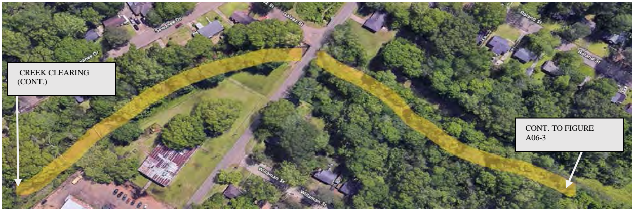
Figure A06-2: PROJECT COJ-04-A06 IMPROVEMENTS