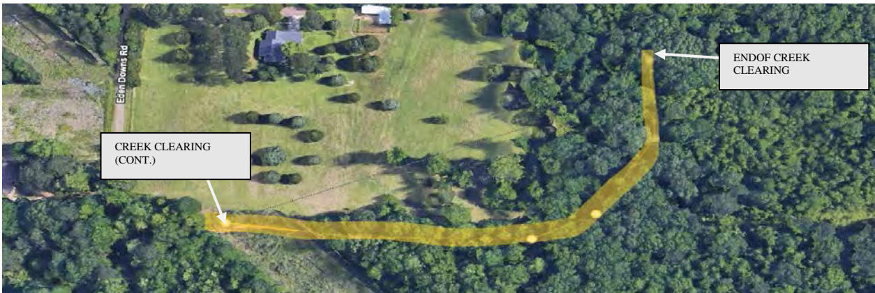
Figure A05-3: PROJECT COJ-04-A05 IMPROVEMENTS