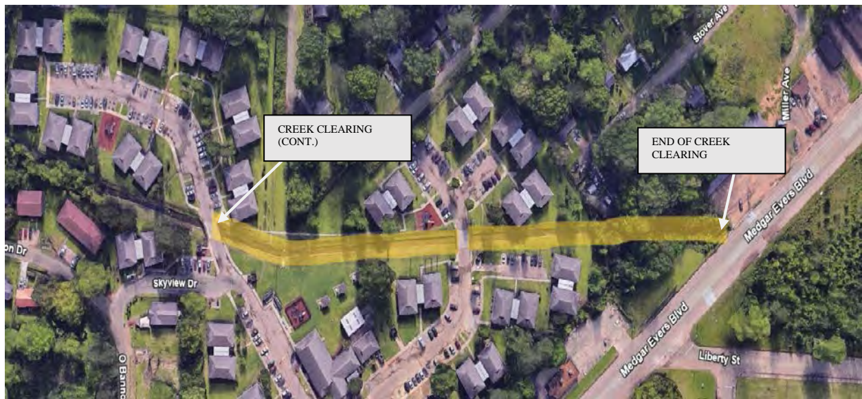
Figure A01-4: PROJECT COJ-04-01 IMPROVEMENTS