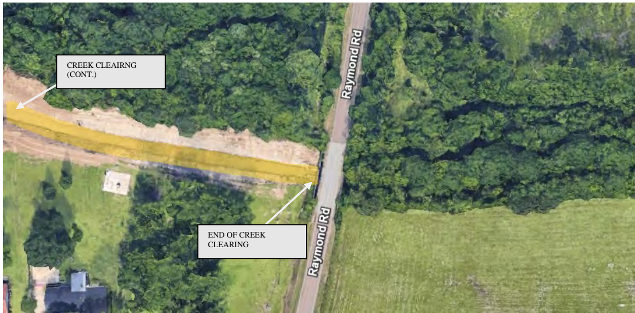
Figure A04-2: PROJECT COJ-04-A04 IMPROVEMENTS