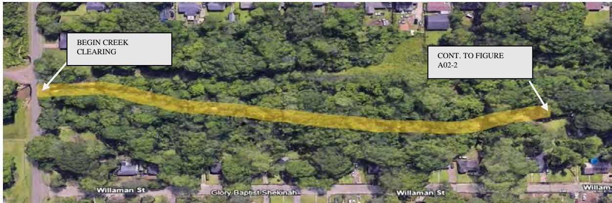
Figure A02-1: PROJECT COJ-04-A02 IMPROVEMENTS