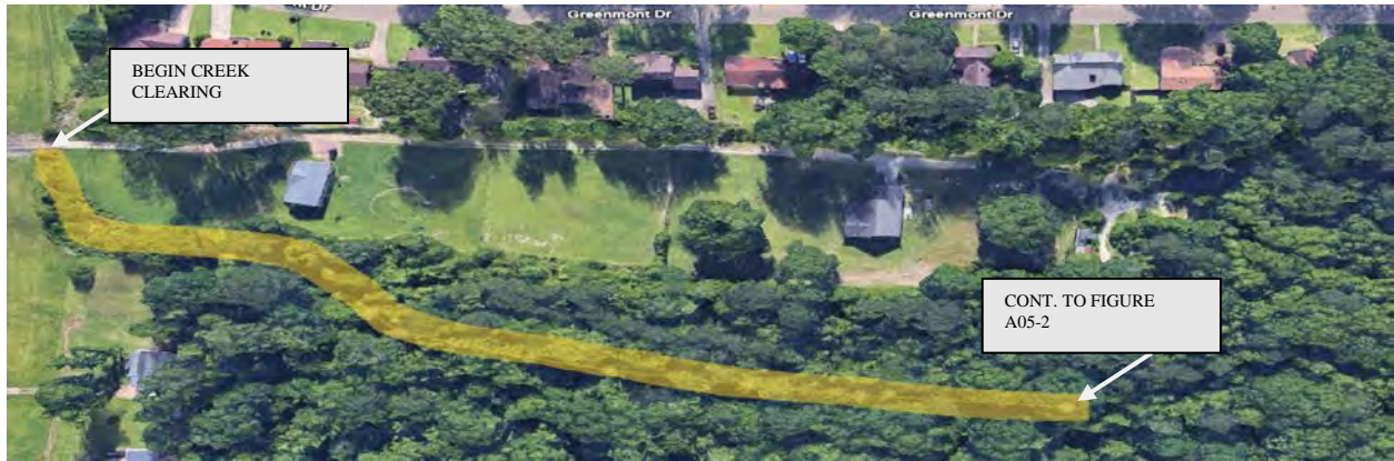
Figure A05-1: PROJECT COJ-04-A05 IMPROVEMENTS