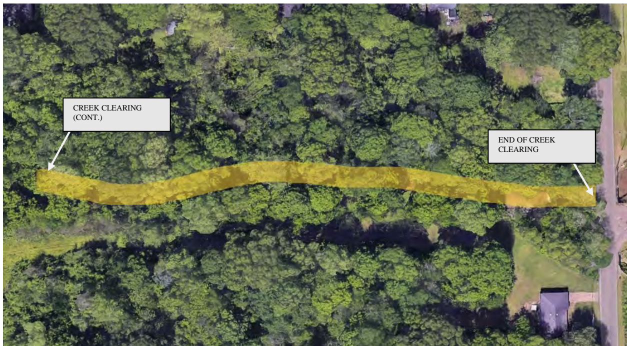
Figure A03-2: PROJECT COJ-04-A03 IMPROVEMENTS