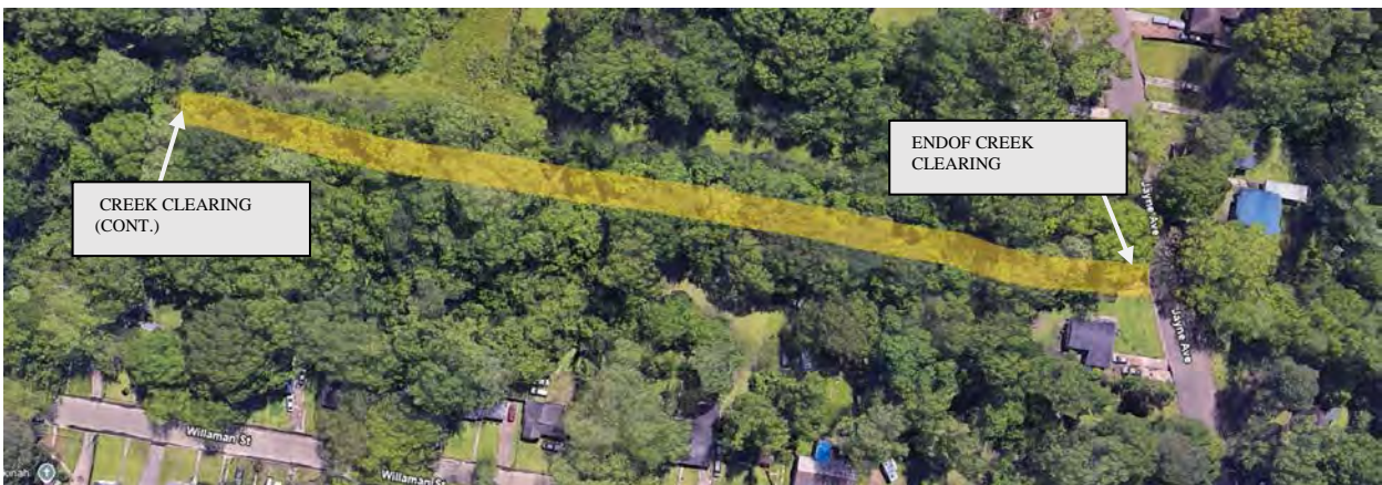
Figure A06-3: PROJECT COJ-04-A06 IMPROVEMENTS