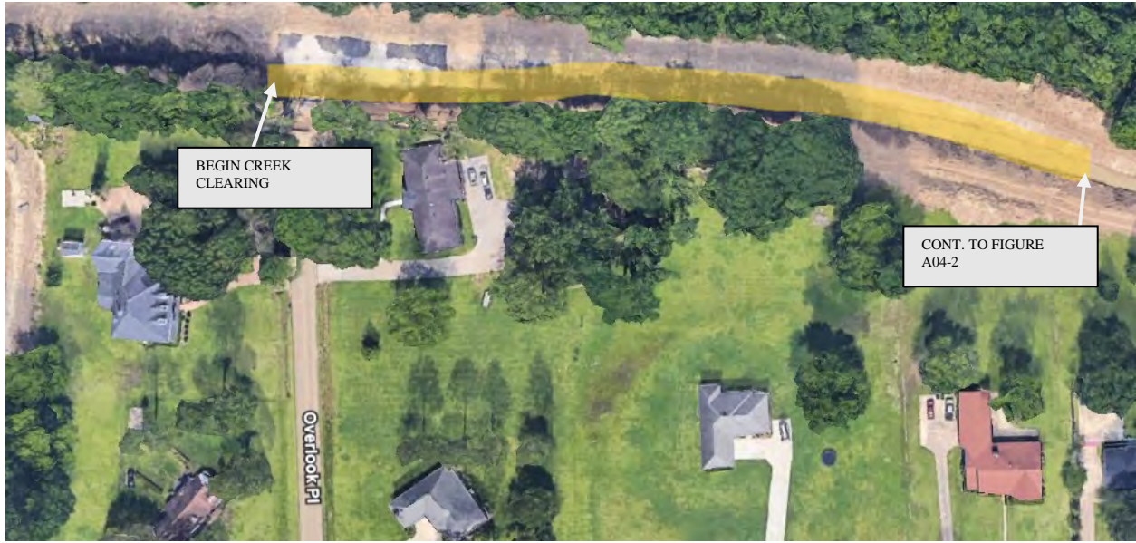
Figure A04-1: PROJECT COJ-04-A04 IMPROVEMENTS