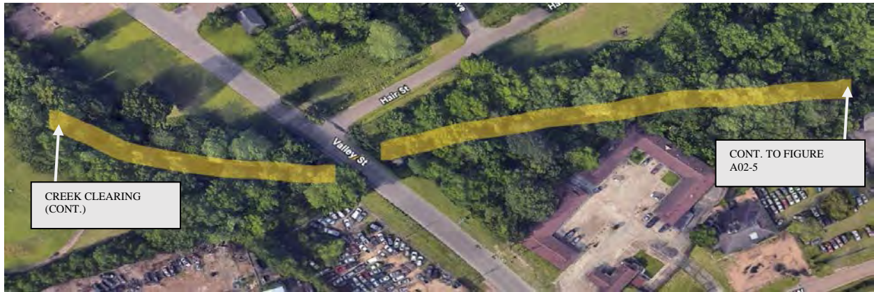
Figure A02-4: PROJECT COJ-05-A02 IMPROVEMENTS