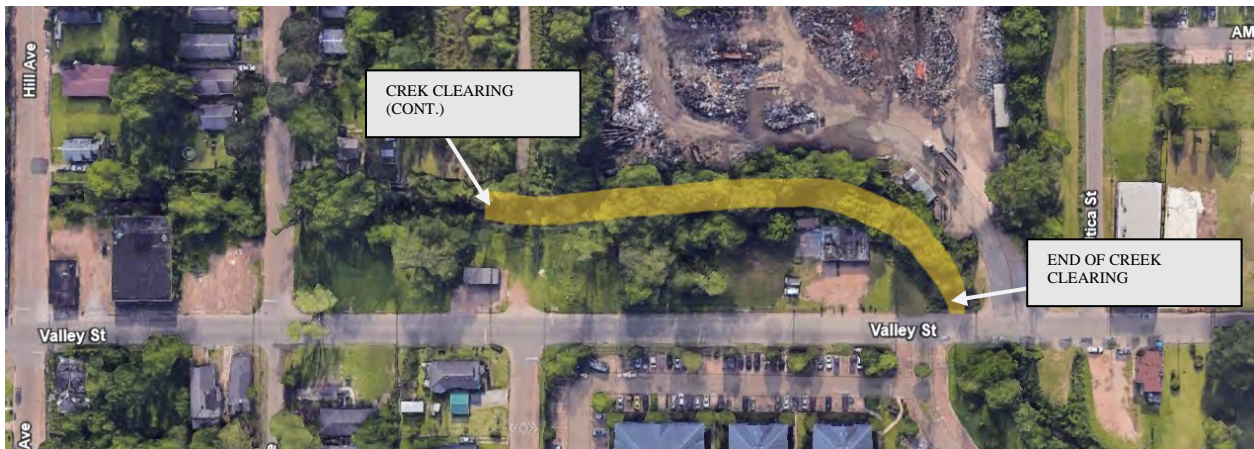
Figure A01-3: PROJECT COJ-05-A01 IMPROVEMENTS