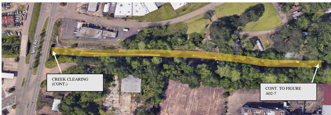
Figure A02-6: PROJECT COJ-05-A02 IMPROVEMENTS