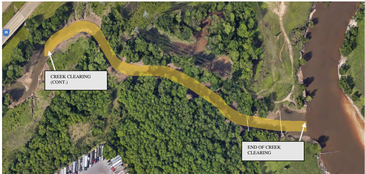
Figure A02-11: PROJECT COJ-05-A02 IMPROVEMENTS