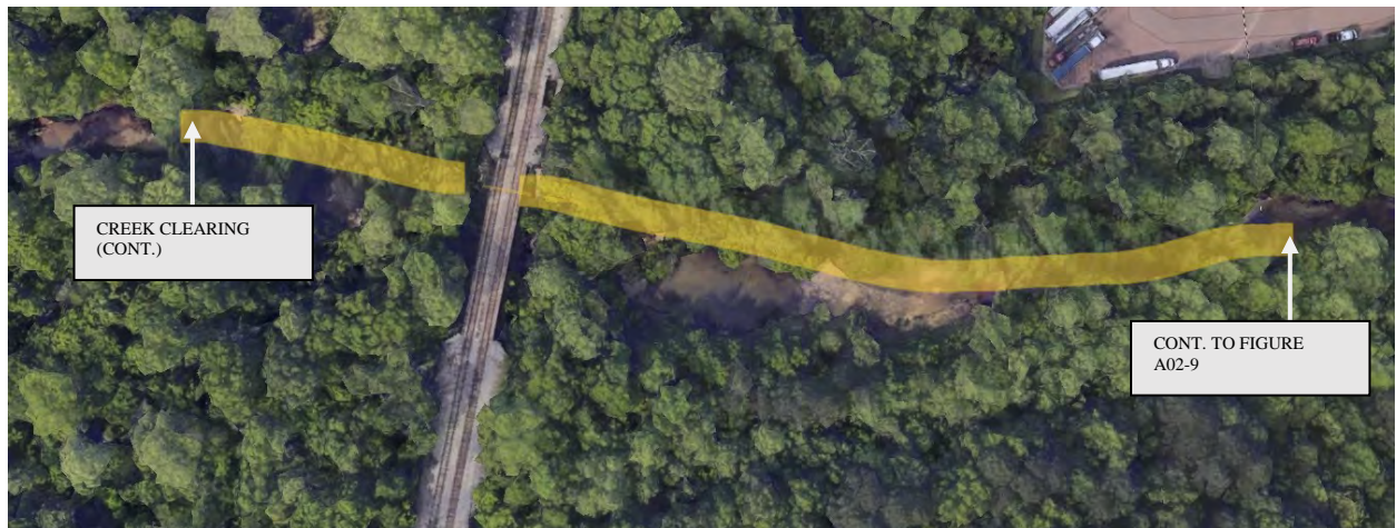
Figure A02-8: PROJECT COJ-05-A02 IMPROVEMENTS