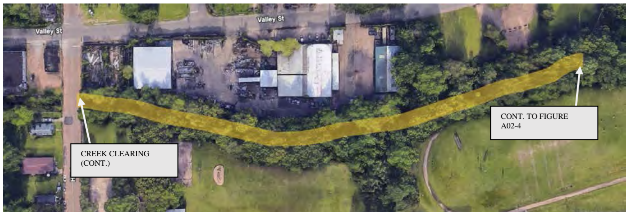
Figure A02-3: PROJECT COJ-05-A02 IMPROVEMENTS