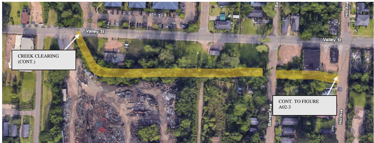
Figure A02-2: PROJECT COJ-05-A02 IMPROVEMENTS