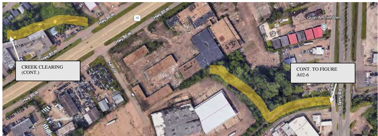
Figure A02-5: PROJECT COJ-05-A02 IMPROVEMENTS