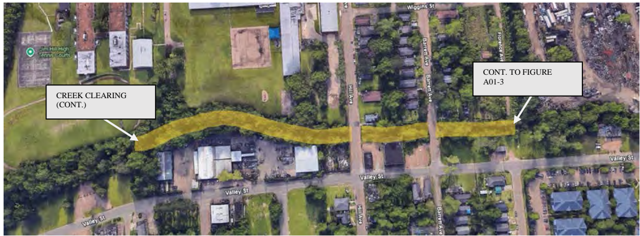
Figure A01-2: PROJECT COJ-05-A01 IMPROVEMENTS