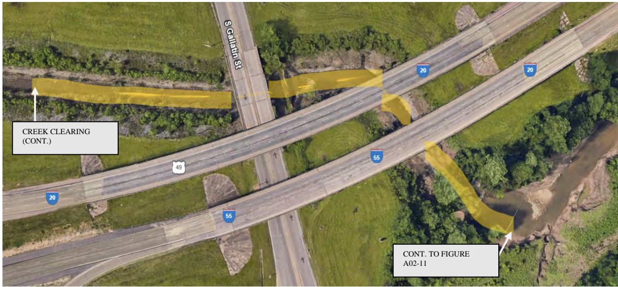
Figure A02-10: PROJECT COJ-05-A02 IMPROVEMENTS