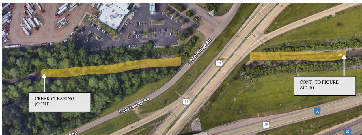
Figure A02-9: PROJECT COJ-05-A02 IMPROVEMENTS