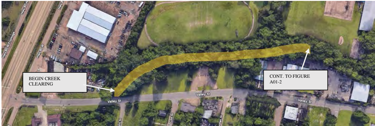
Figure A01-1: PROJECT COJ-05-A01 IMPROVEMENTS