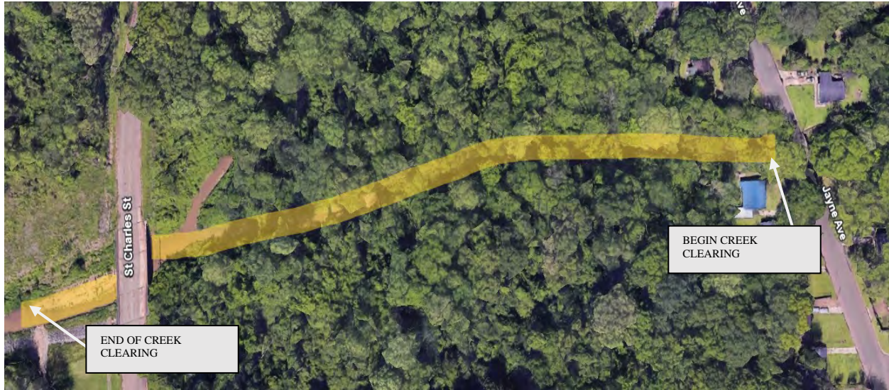
Figure A03-1: PROJECT COJ-05-A03 IMPROVEMENTS