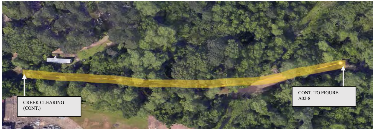
Figure A02-7: PROJECT COJ-05-A02 IMPROVEMENTS