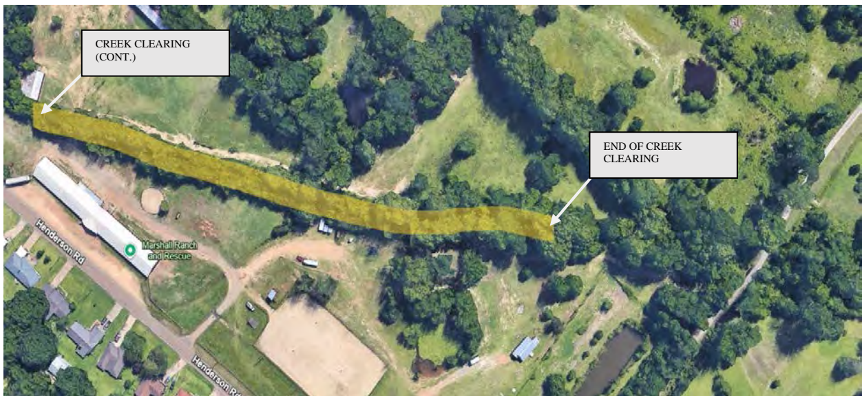
Figure A06-2: PROJECT COJ-06-A06 IMPROVEMENTS