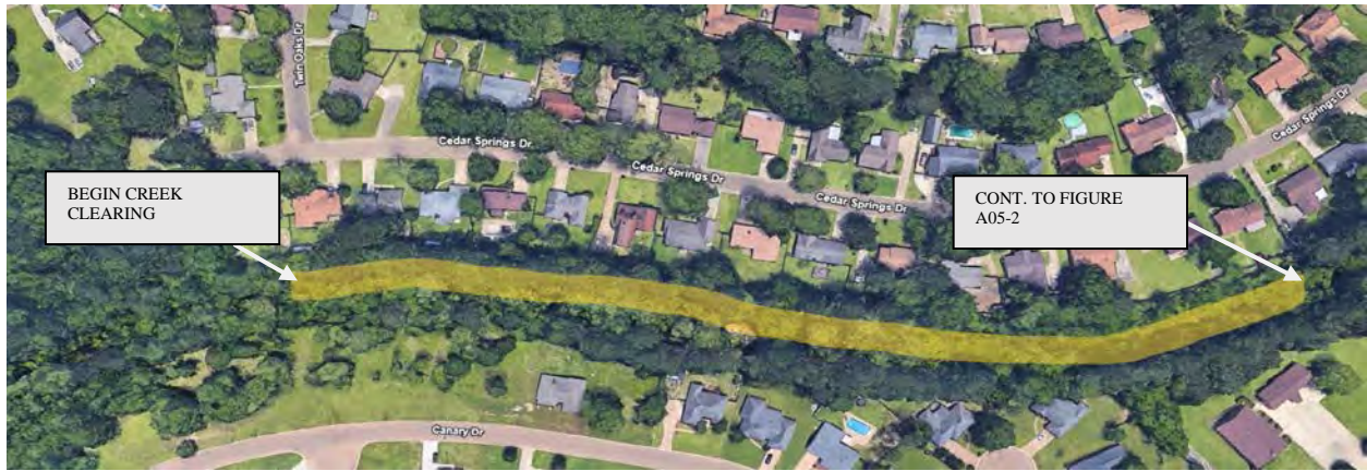
Figure A05-1: PROJECT COJ-06-A05 IMPROVEMENTS