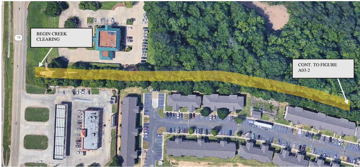
Figure A03-1: PROJECT COJ-06-A03 IMPROVEMENTS