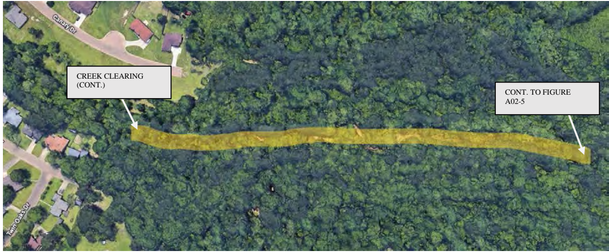
Figure A02-4: PROJECT COJ-06-A02 IMPROVEMENTS