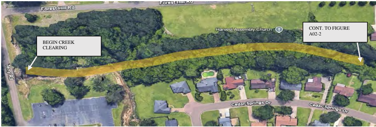
Figure A02-1: PROJECT COJ-06-A02 IMPROVEMENTS