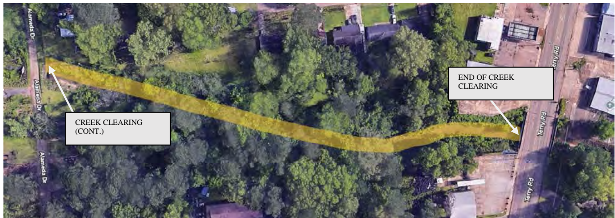
Figure A04-3: PROJECT COJ-06-A04 IMPROVEMENTS