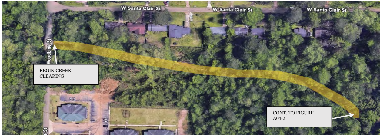
Figure A04-1: PROJECT COJ-06-A04 IMPROVEMENTS