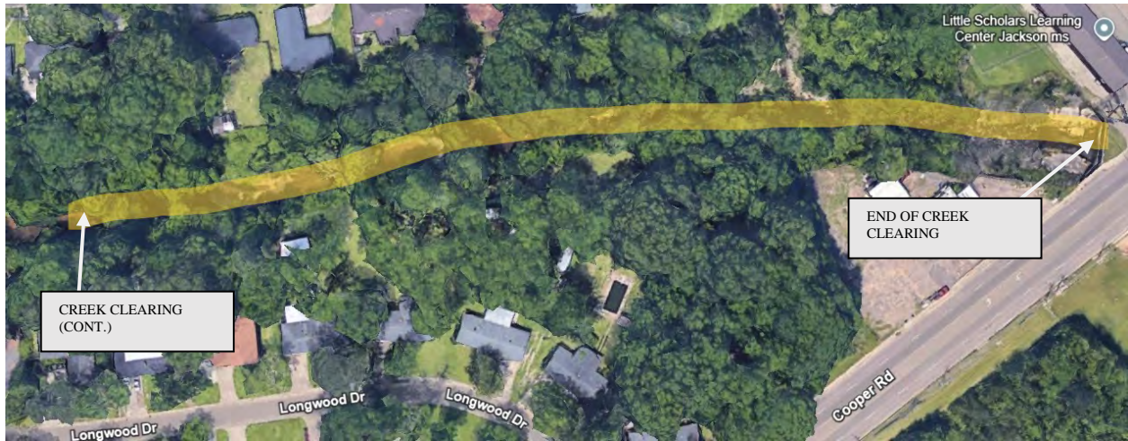
Figure A01-7: PROJECT COJ-06-A01 IMPROVEMENTS