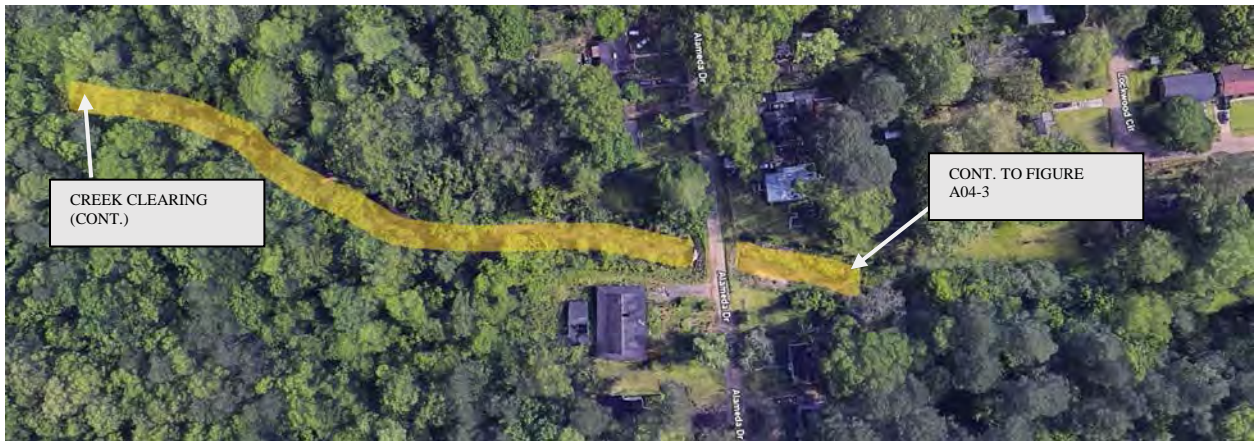
Figure A04-2: PROJECT COJ-06-A04 IMPROVEMENTS