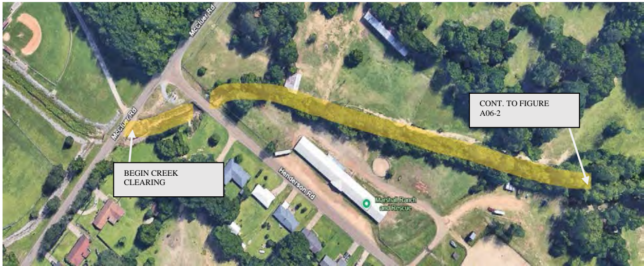
Figure A06-1: PROJECT COJ-06-A06 IMPROVEMENTS