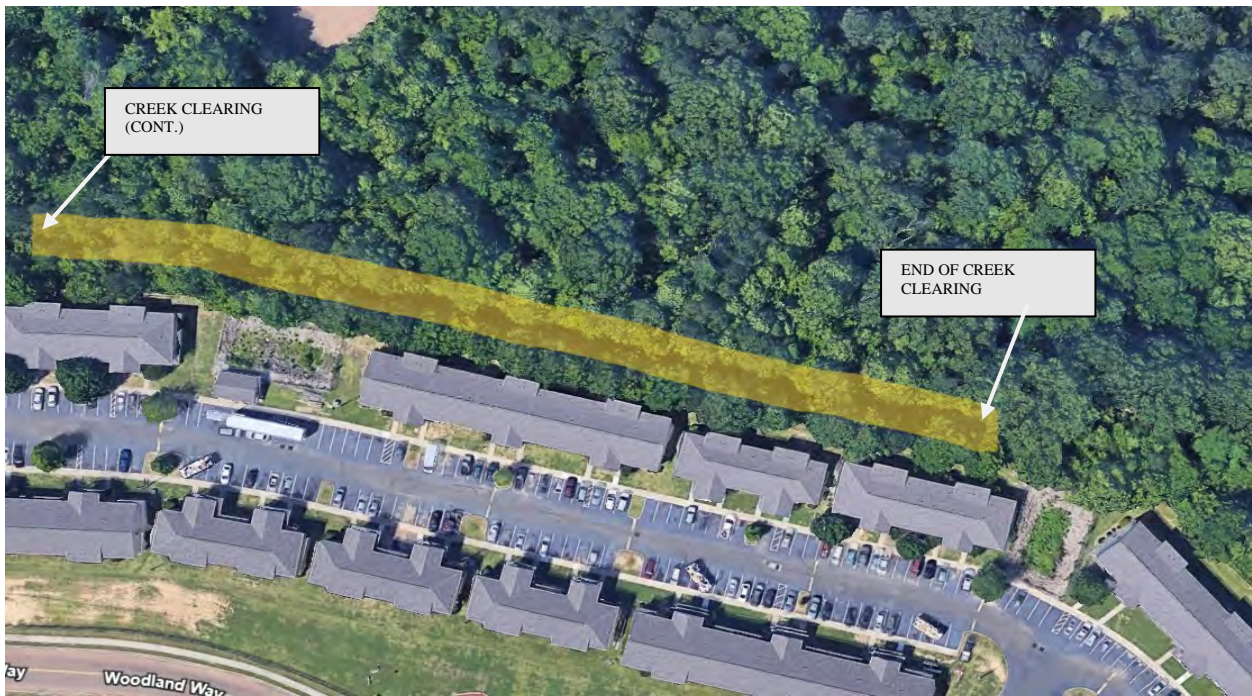
Figure A03-2: PROJECT COJ-06-A03 IMPROVEMENTS