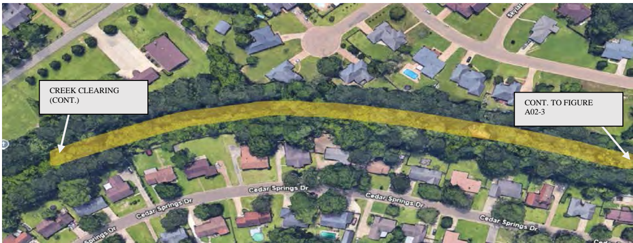
Figure A02-2: PROJECT COJ-06-A02 IMPROVEMENTS