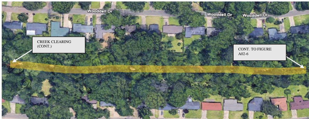
Figure A01-5: PROJECT COJ-06-A01 IMPROVEMENTS