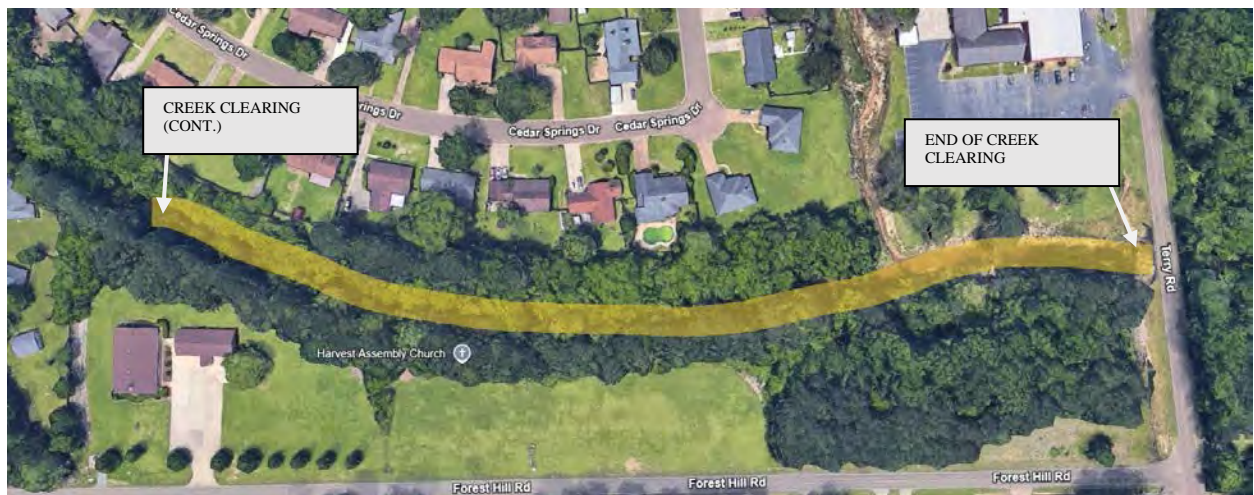
Figure A05-3: PROJECT COJ-06-A05 IMPROVEMENTS