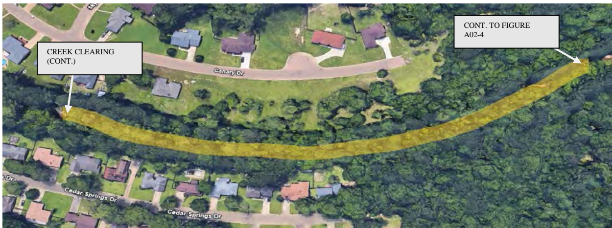
Figure A02-3: PROJECT COJ-06-A02 IMPROVEMENTS