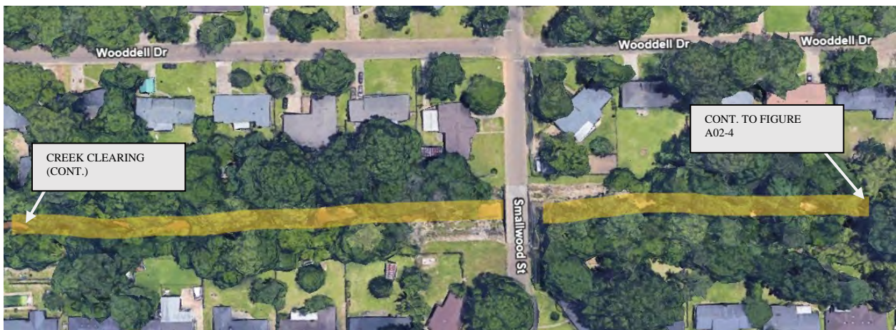
Figure A01-3: PROJECT COJ-06-A01 IMPROVEMENTS