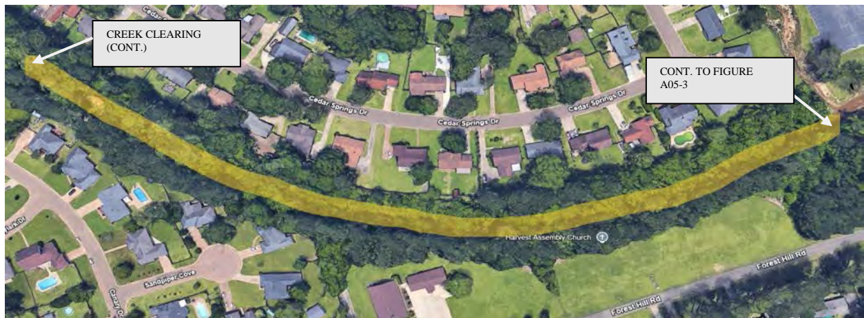
Figure A05-2: PROJECT COJ-06-A05 IMPROVEMENTS