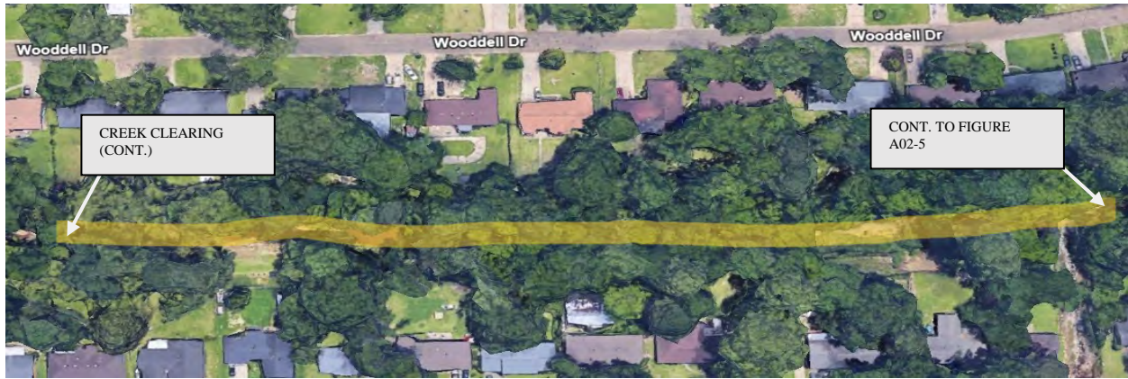
Figure A01-4: PROJECT COJ-06-A01 IMPROVEMENTS