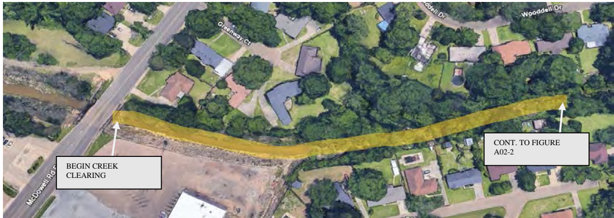
Figure A01-1: PROJECT COJ-06-A01 IMPROVEMENTS