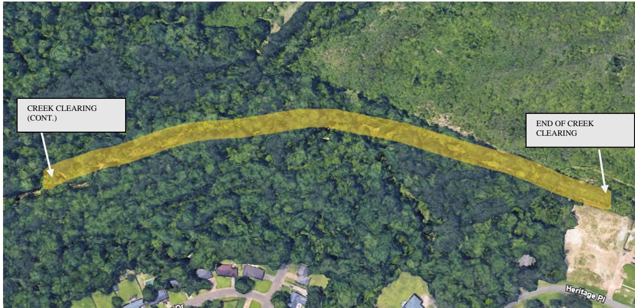
Figure A02-5: PROJECT COJ-06-A02 IMPROVEMENTS