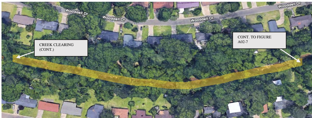
Figure A01-6: PROJECT COJ-06-A01 IMPROVEMENTS